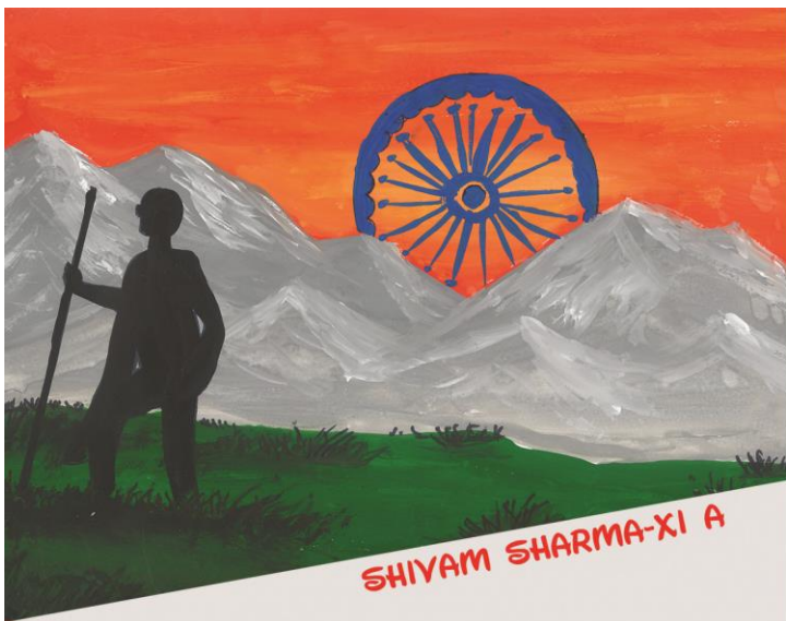
SHIVAM SHARMA-XI A